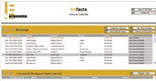
Requesters can book company resources through the resource booking intranet screen.